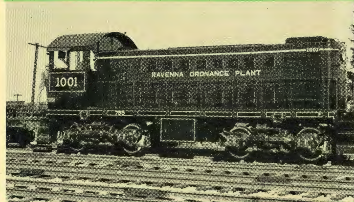
DIESEL-ELECTRIC . One of the powerful 100-ton Diesel-Electric engines being used throughout the area is pictured above. There will be 12 other Diesel-Electric locomotives of lighter design.