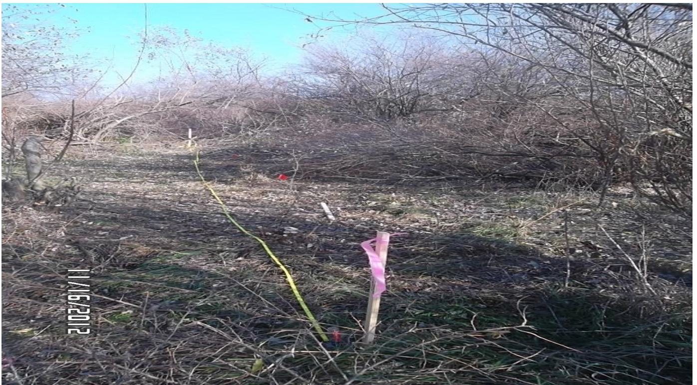
Measuring excavation area of former USTs RV-17, RV-18, and RV-19. View is looking to the north towards former Bldg. A6 concrete pad. Stake in foreground is southwest corner of excavation area.