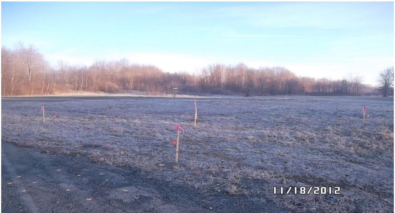
View of location of former UST RV-88 located to the west of former Bldg. 1103. Stakes in photo delineates the geophysical survey area.