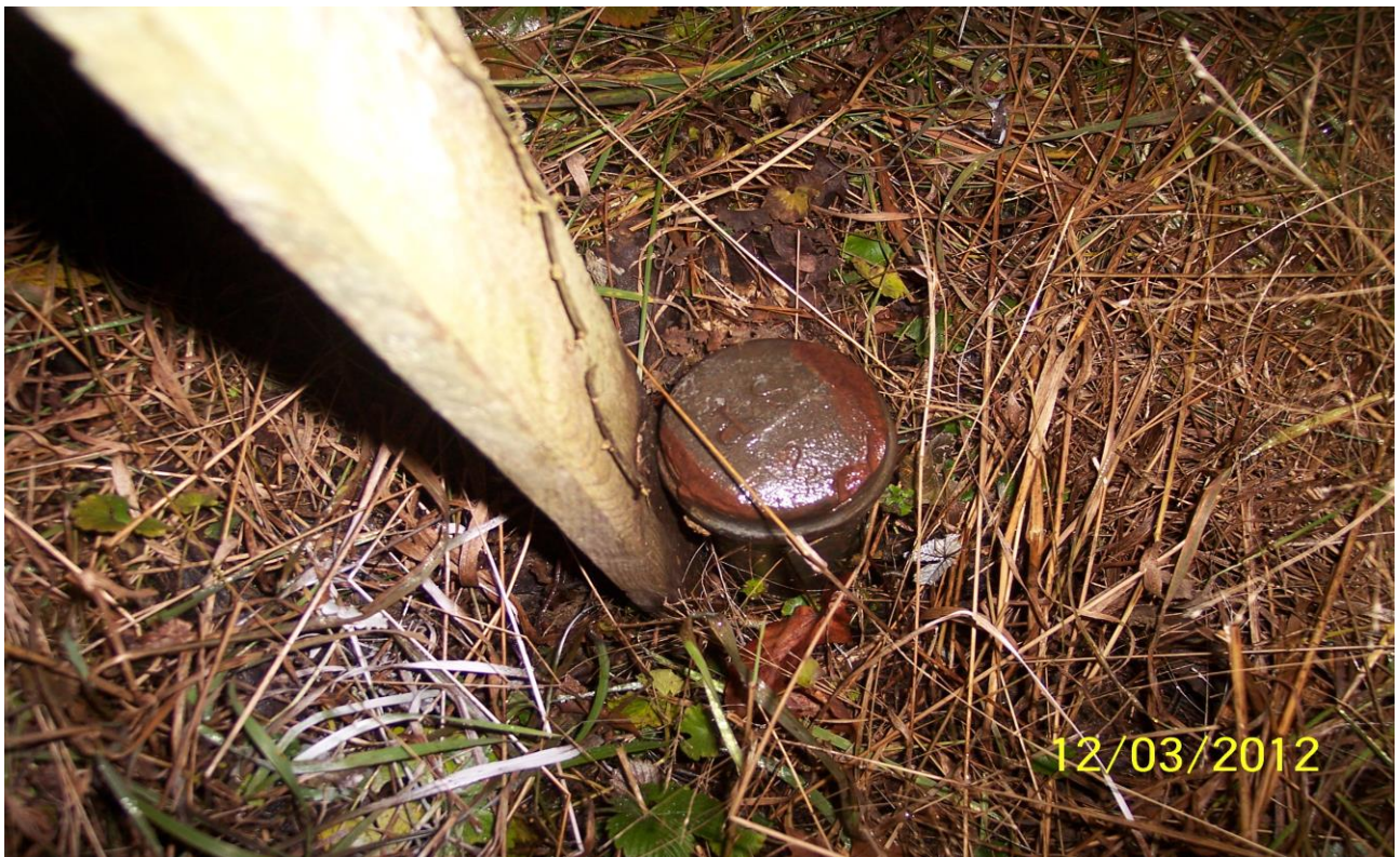
View of former fill pipe at RV-87.