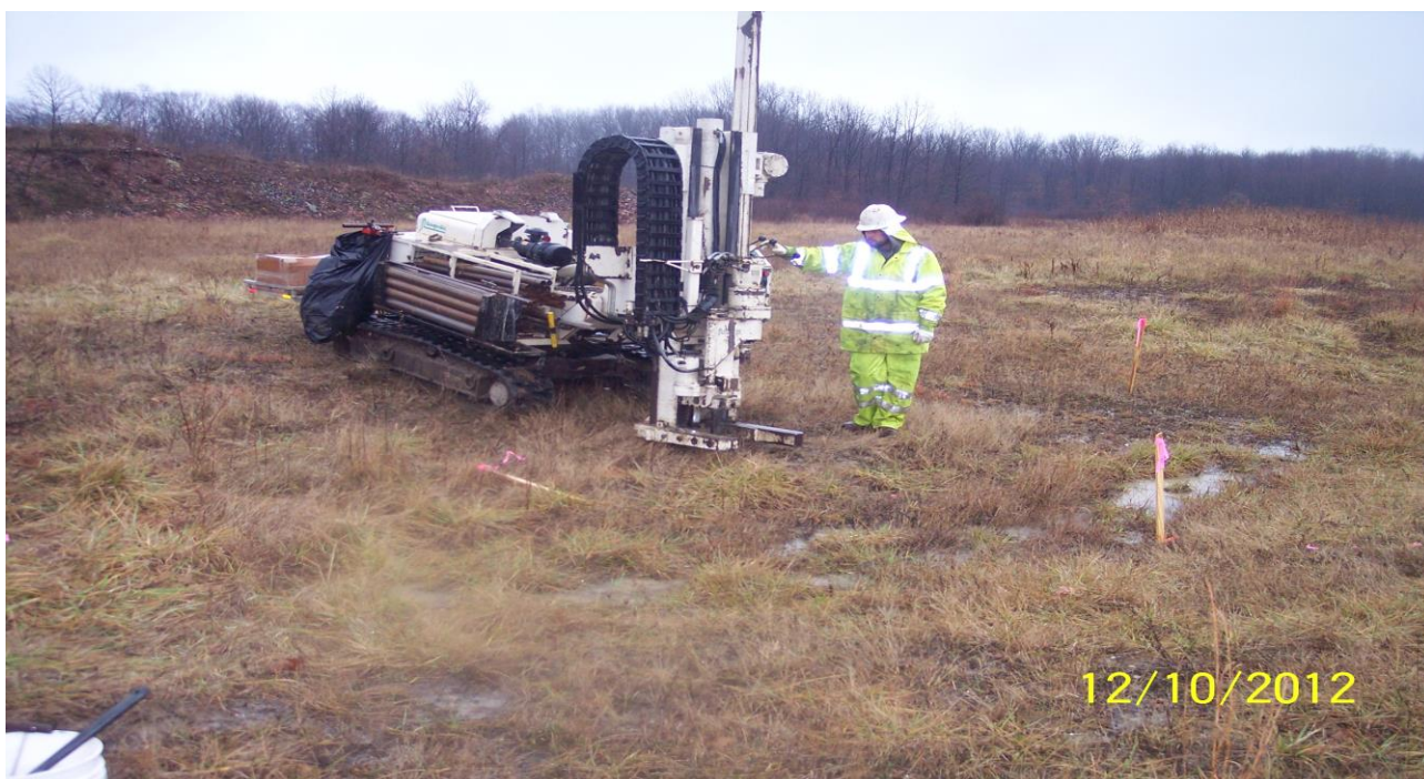
View of location of former UST RV-41 located at LL 6. Stakes in photo mark the boring locations for RV-41. Note depressed ground surface and standing surface water in area of borings, indicating possible previously excavated area. View is looking to the northeast.