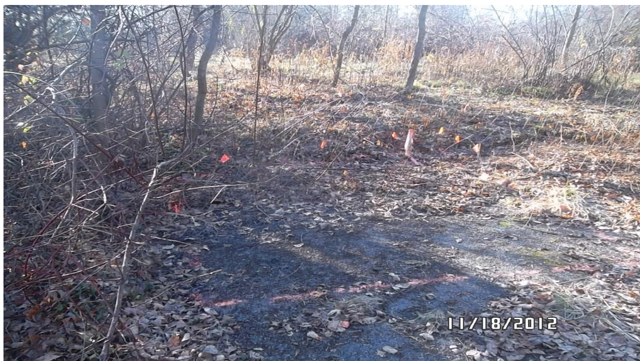
View of location of UST RV-46 located at former Building EE-102 (Bolton Manor) in the Depot Area. Pin flags and orange marking paint in photo indicates area of geophysical survey. View is looking to the southeast. The geophysical survey did identify an anomaly within the survey area.