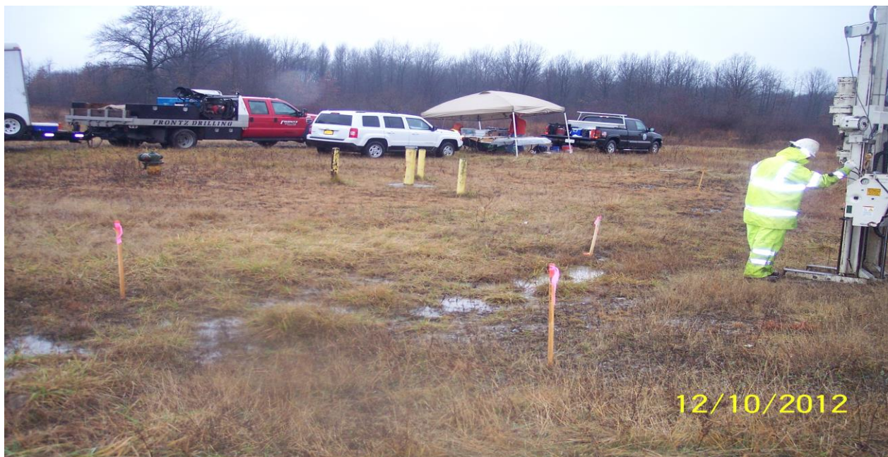
View of boring locations at former UST RV-41 at Load Line (LL) 6. Stake in far right background indicates western extent of geophysical survey.