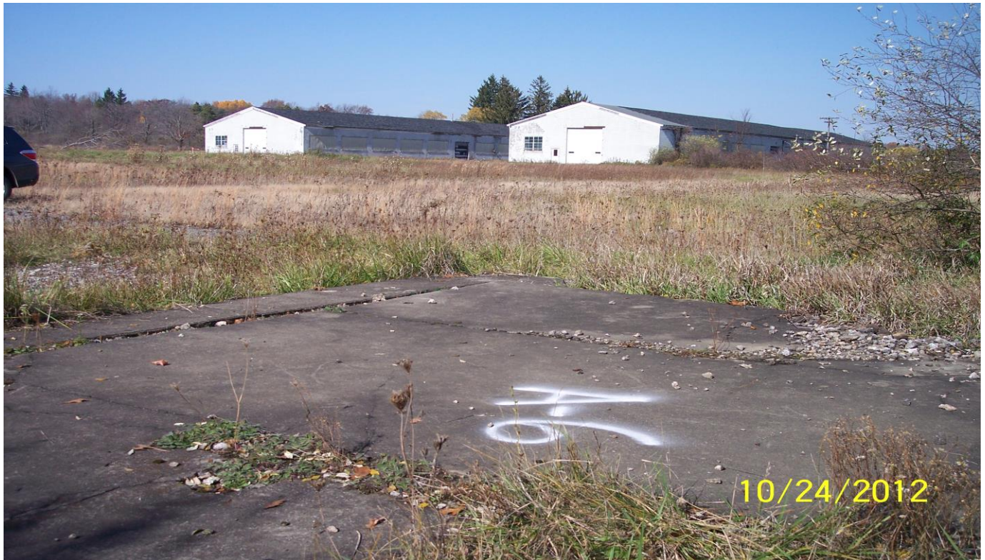
View of concrete slab of former Bldg. A6 located within the Depot Area. View is looking northwest.