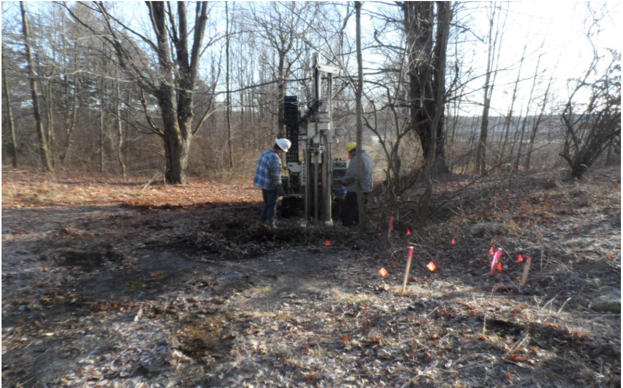
View of direct push boring activities at UST RV-46. View is looking east.