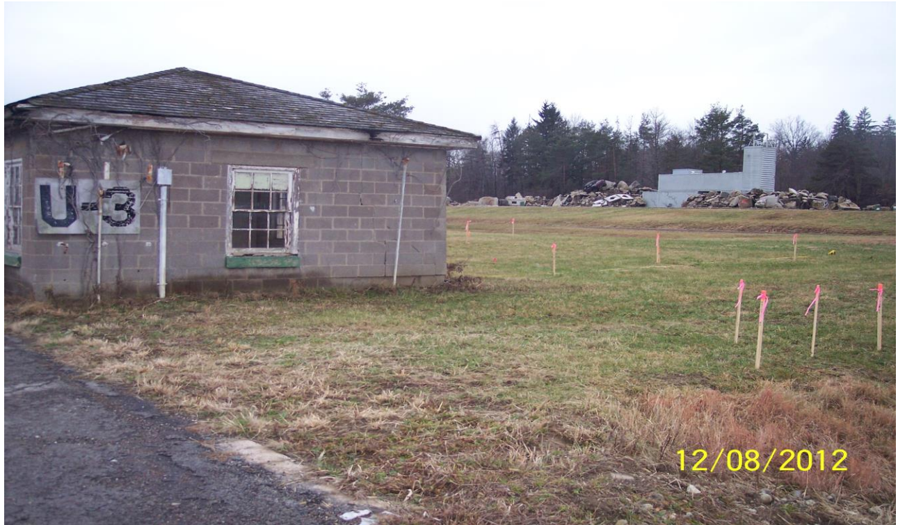
Photo of staked boring locations for Bldg. U-3 former USTs RV-15 and RV-16. Stakes in right forefront are staked borings for the UST investigation for CC-RVAAP-72-01.