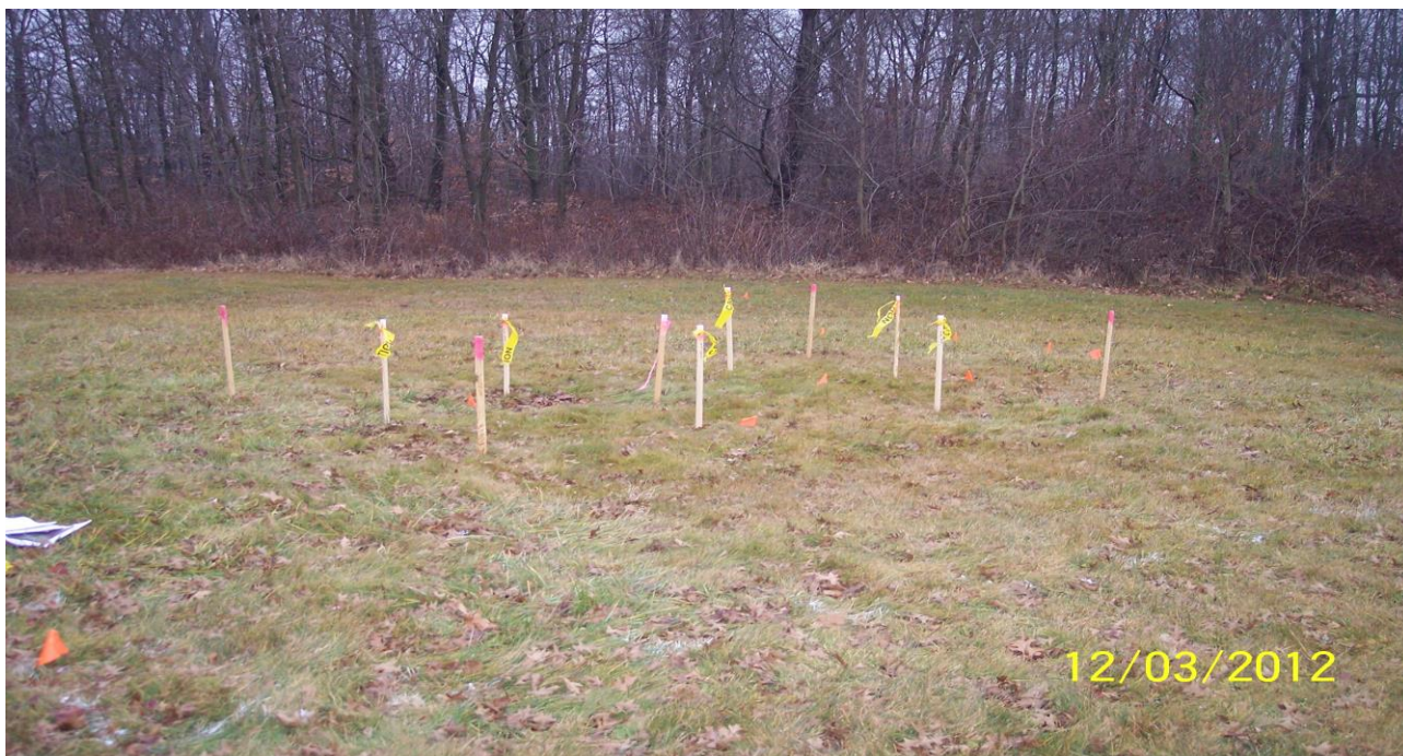
View of former UST location RV-86. Stakes with yellow flagging denote direct-push boring locations. Outside stakes denote geophysical survey area. Note depressed ground surface within geophysical survey area indicating possible previously excavated area.