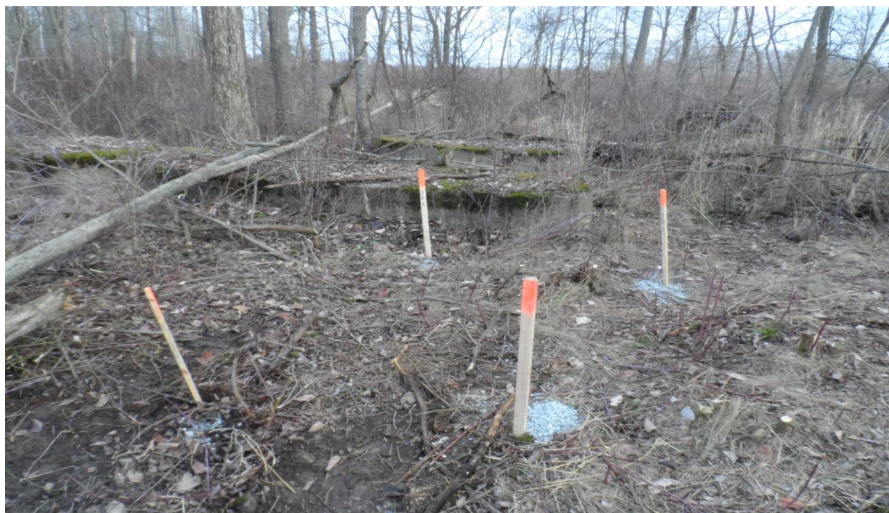
View of former UST location CC-RVAAP-72-02 within the Atlas Scrap Yard. Concrete structures in background possible former pump islands.