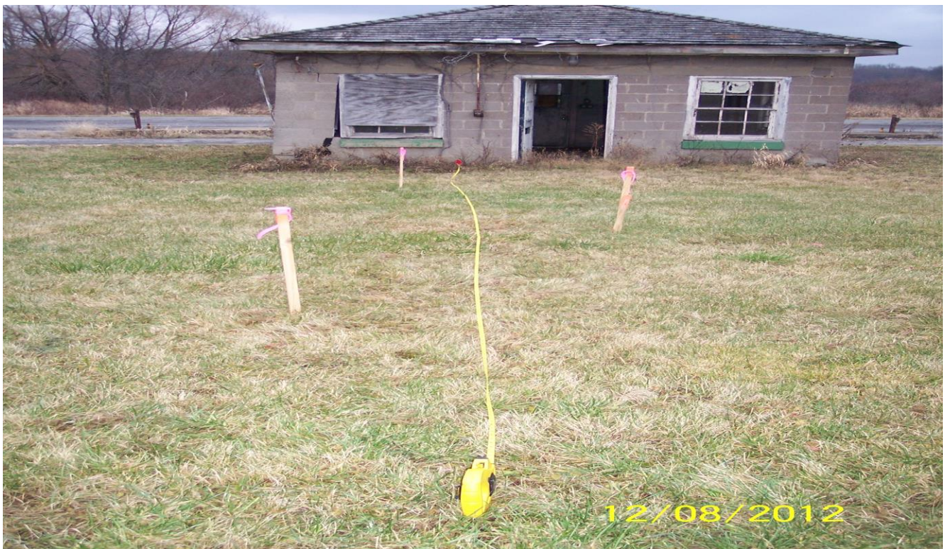
Laying out boring locations behind Bldg. U-3.