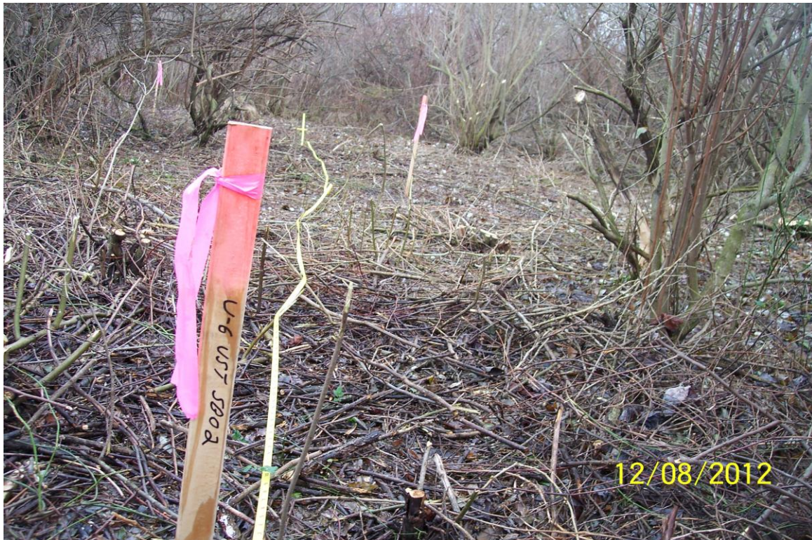
Photo of staked boring locations SB02, SB03, and SB04 (far left background) at Bldg. U-6. View is to the east.