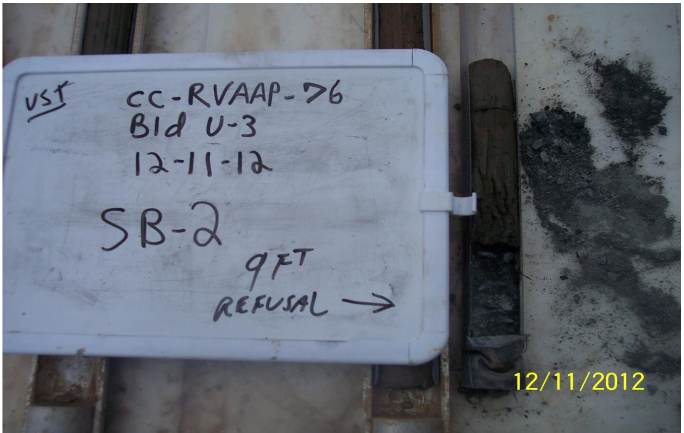
Photo of soil interval from 9 ft bgs showing refusal material at Bldg. U-3 SB02.