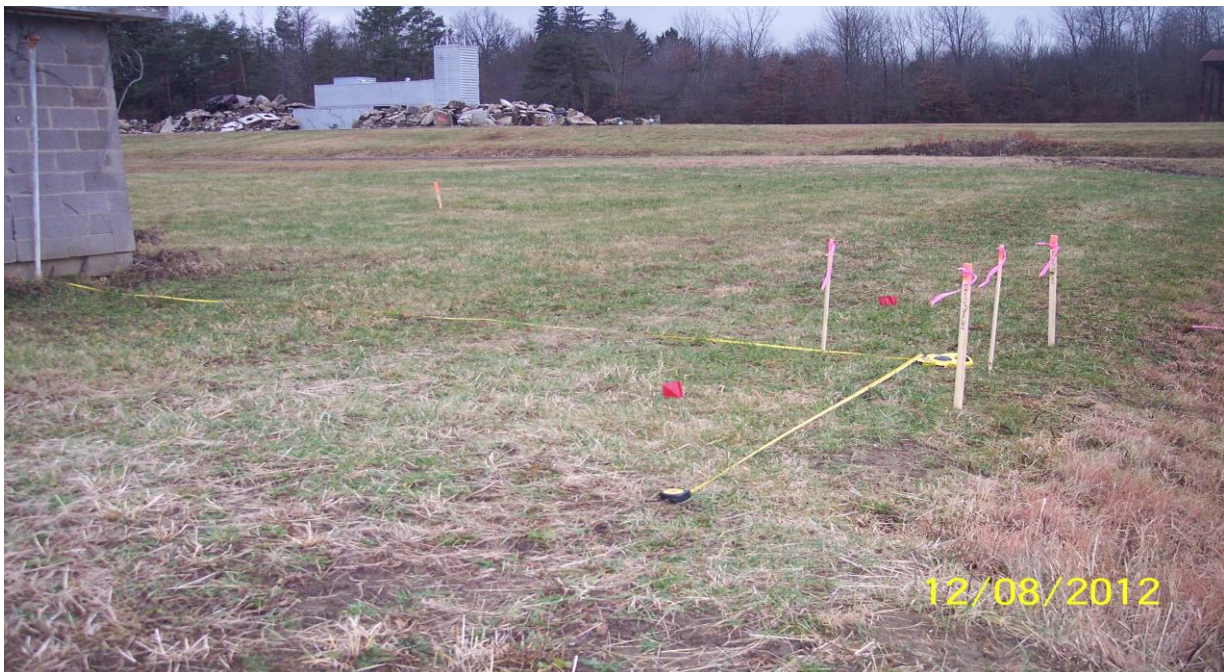
View of staked location of former UST CC-RVAAP-72-01 at Bldg. U-3 in the Depot Area. Location of UST is approximately 20 ft to the north of Bldg. U-3 (in left of photo), next to a drainage ditch.