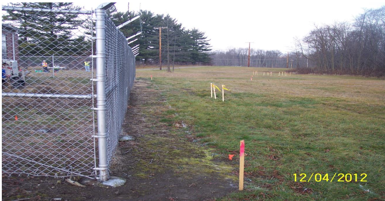
View of location of former UST RV-4 located to the east of Bldg. 1026. Stake in foreground delineates the southwest corner of the geophysical survey area. Three stakes in the middle of the photo mark the boring locations for RV-4. Staked locations in the far background show location of former UST RV-86. Direct-push drill rig in left portion of photo is advancing borings at former UST RV-87.