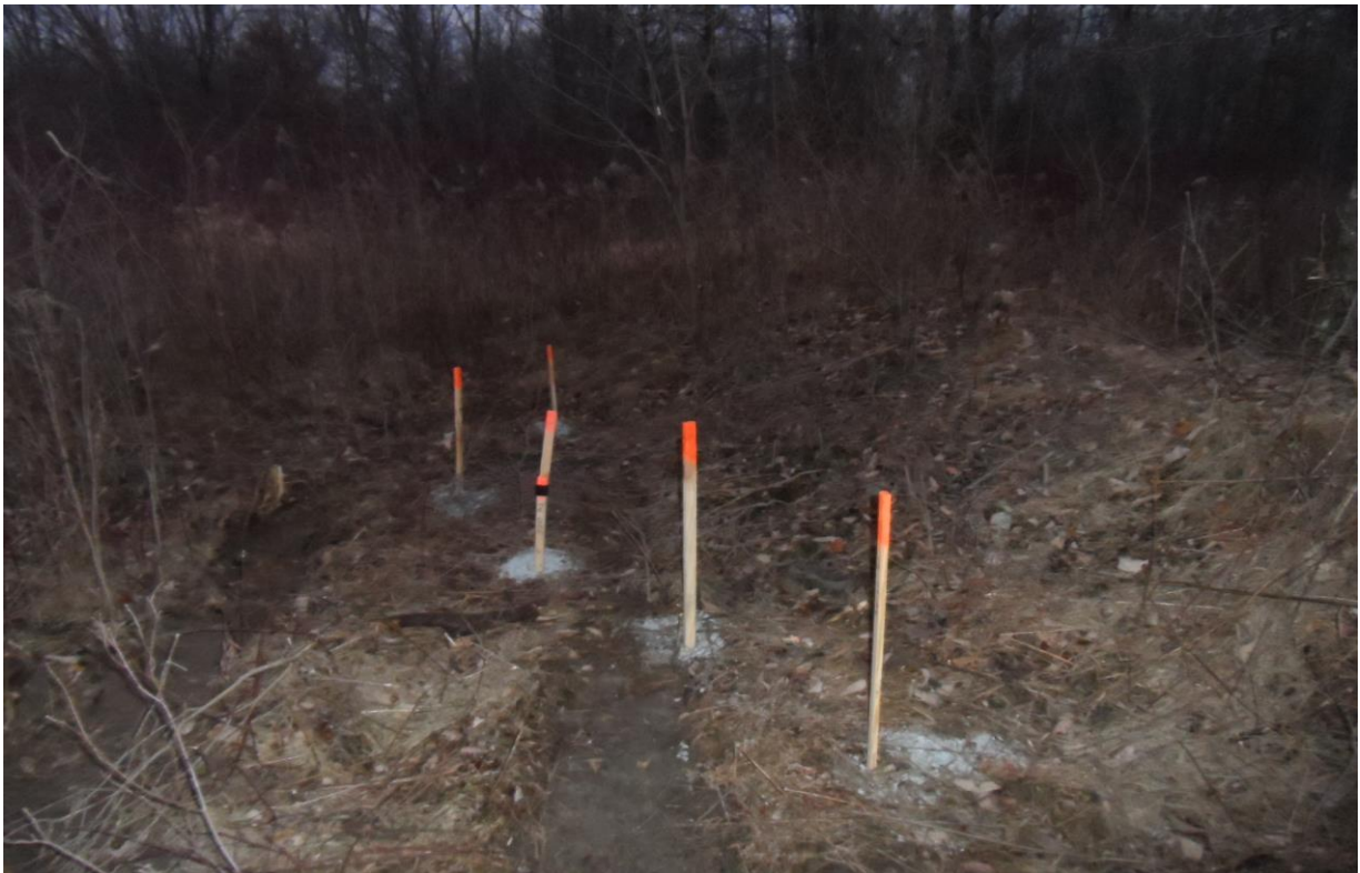
View of borings at former Atlas Scrap Yard UST location CC-RVAAP-72-03.