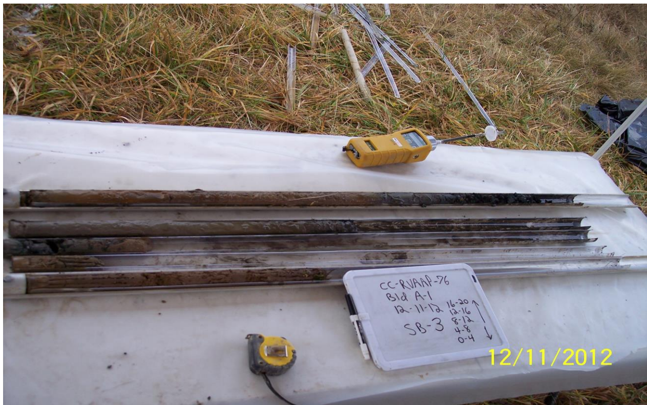
View of soil samples collected at SB03 at former UST location RV-37 at Building A1.