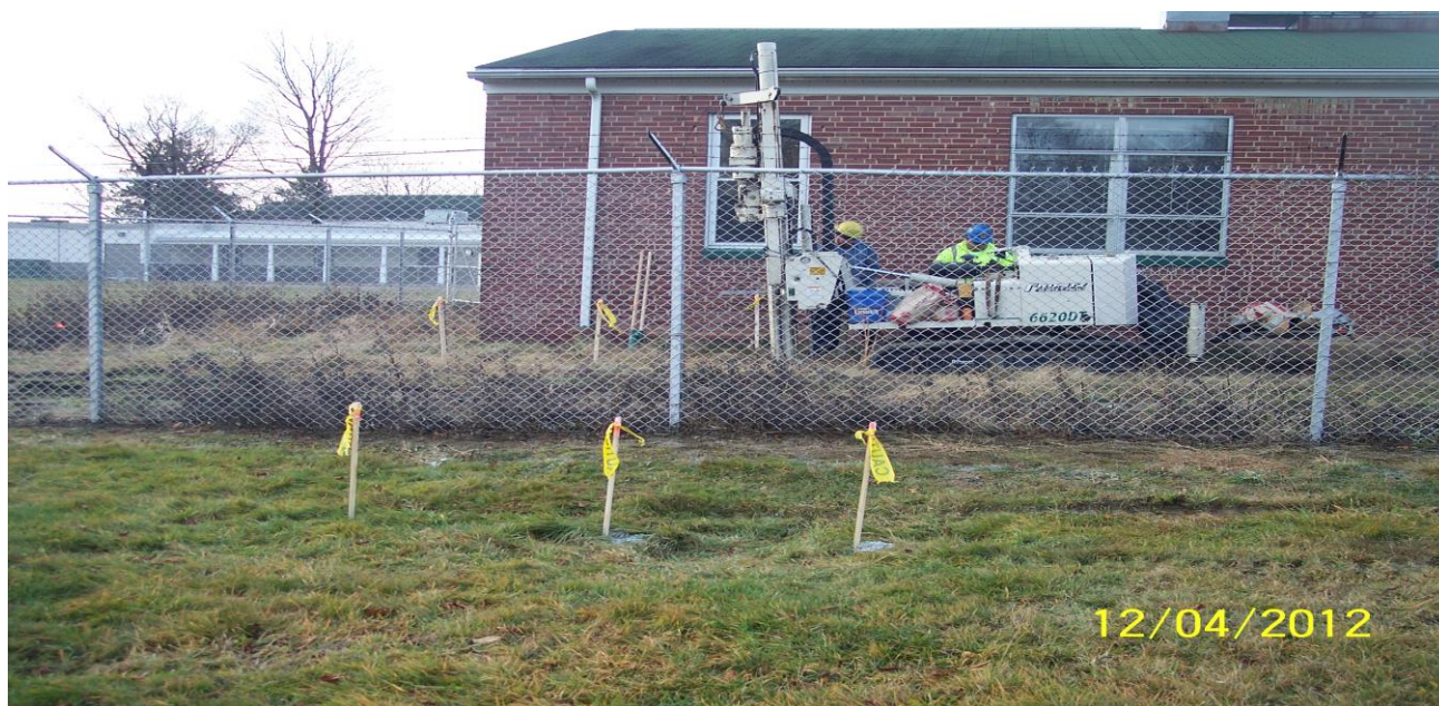
View of boring locations at former USTs RV-4 (three stakes in foreground, note depression in ground may indicate previously excavated area), and RV-87 (sampling in progress) behind Building 1026.