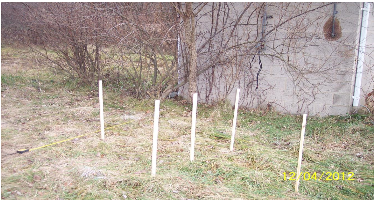
View of location of former UST RV-89 at the Georges Road Treatment Plant. Chlorine building is in background, view is looking east northeast. Stakes indicate direct-push boring locations.