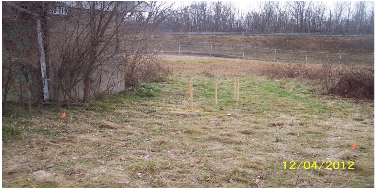
View of location of former UST RV-89 at the Georges Road Treatment Plant. Chlorine building is to the left, view is looking south. Orange pin flags in photo indicated extent of geophysical survey area.