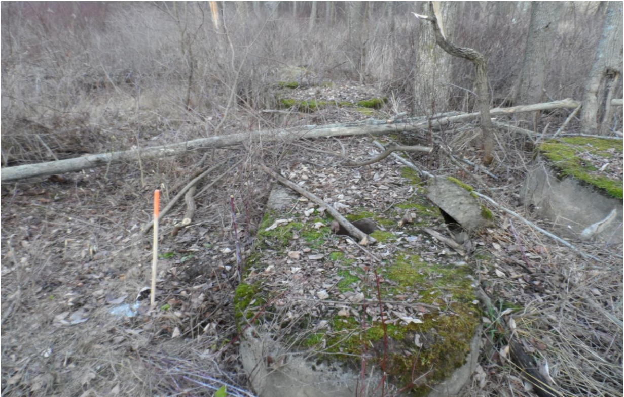
View of former Atlas Scrap Yard UST location CC-RVAAP-72-02 SB03 next to concrete structure.