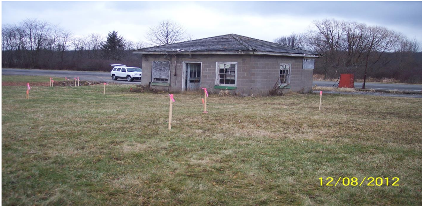
Photo of boring locations behind Bldg. U-3. Stakes for UST CC-RVAAP-72-01 are in left background.