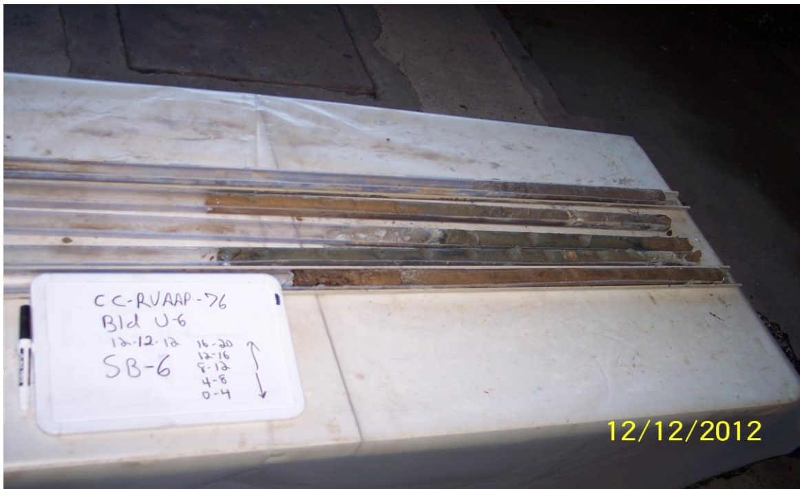
Photo of Bldg. U-6 soil boring SB06 sample intervals.