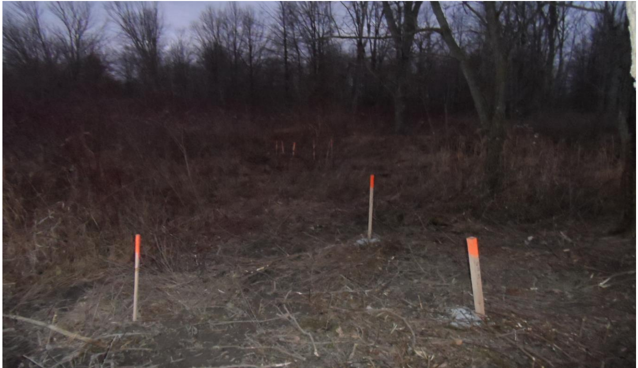
View of borings at former Atlas Scrap Yard UST location CC-RVAAP-72-03.