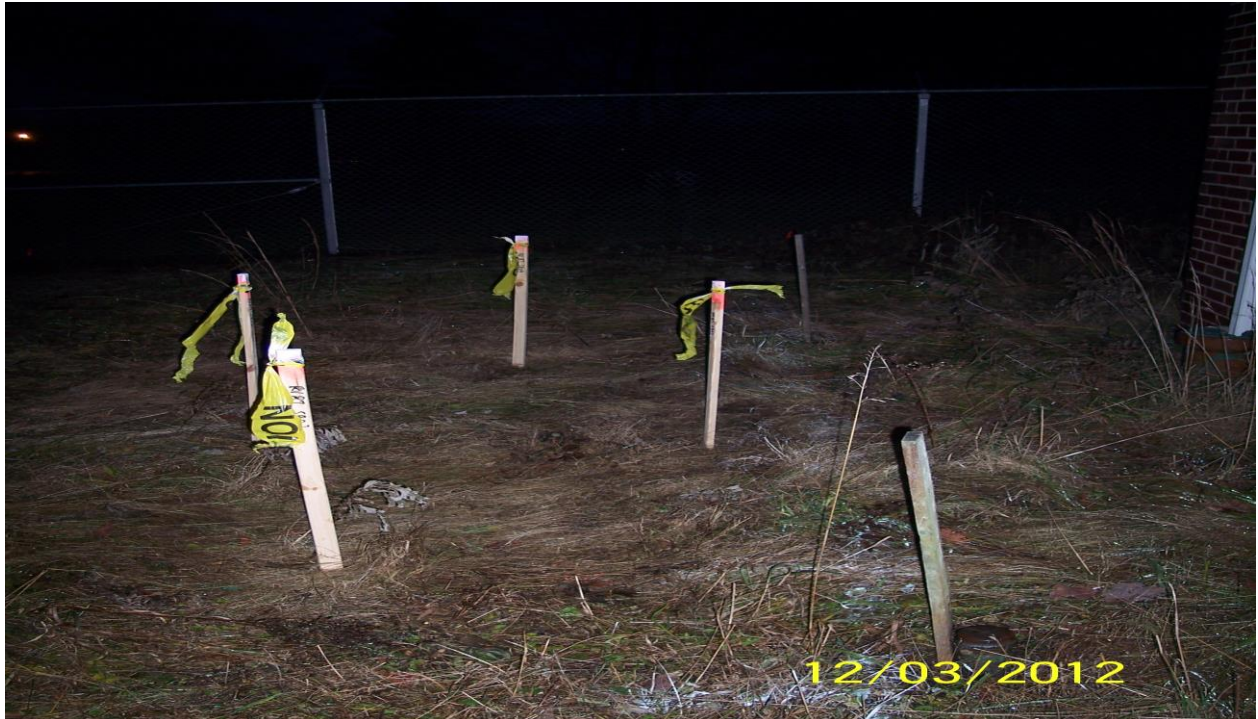
View of boring locations for RV-87 behind Bldg. 1026. The stake not flagged in the right side of the photo indicates the location of one of the former fill pipes.