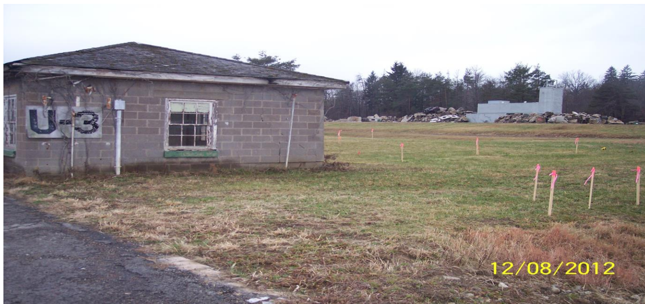
View of staked boring locations at former UST CC-RVAAP-72-01 at Bldg. U-3. Stakes in background are boring locations for hexavalent chromium investigation at former USTs RV-15 and RV-16. View is looking south southwest. Former Bldg. U10 is in the background.