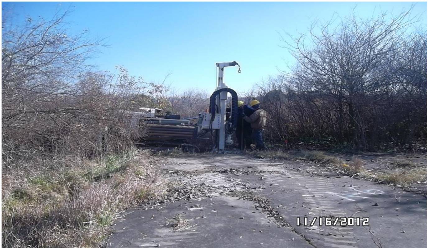
View of direct push drilling activities at RV-97, former 550-gal UST located along the east side of former Bldg. A6. View is looking east.