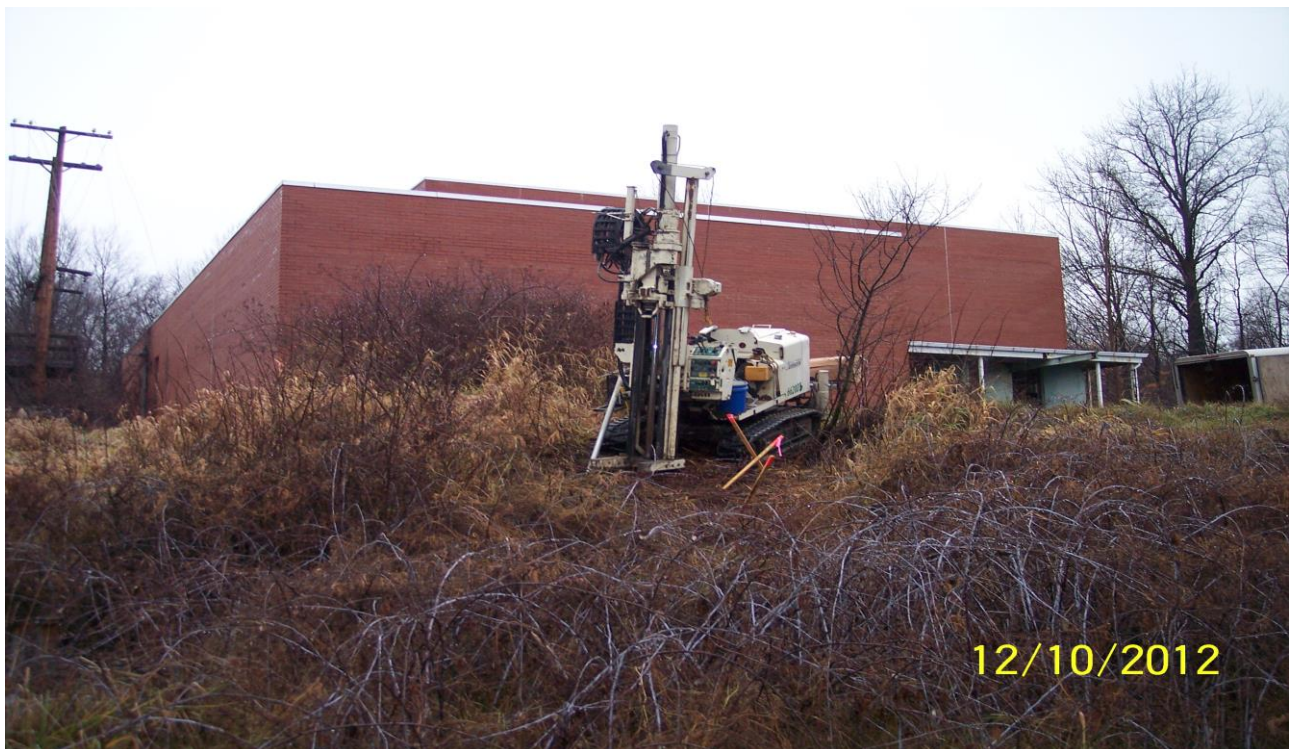
View of direct-push drill rig at former UST CC-RVAAP 72-06. View is looking west northwest.