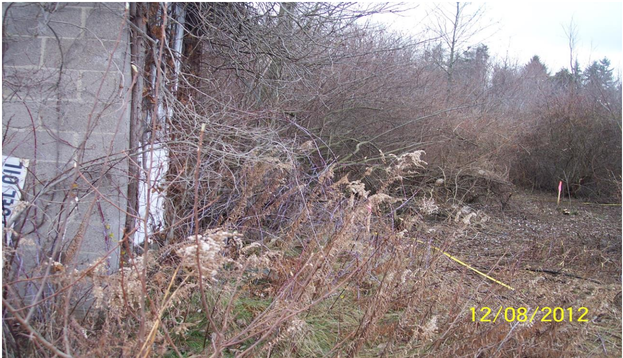
Photo of staked boring locations to the northeast of Bldg. U-6. View is looking north.