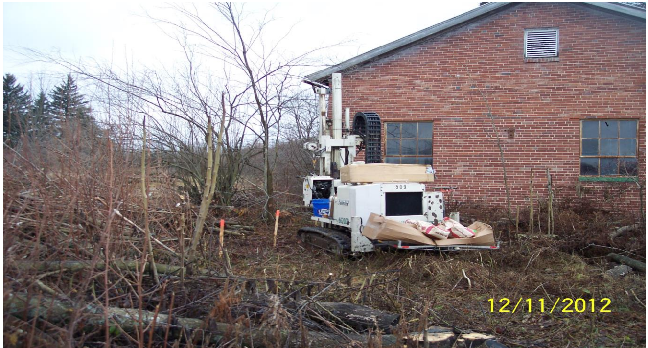
View of direct push drilling activities at former UST location RV-37 at Building A1 in the Depot Area. View is looking south southwest. Stakes in photo denote boring locations.