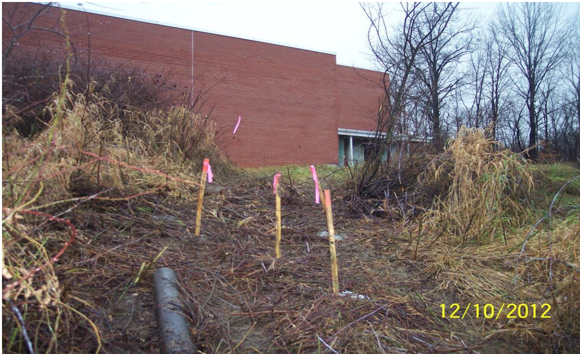
View of completed borings at former UST CC-RVAAP-72-06. Borings have been backfilled with bentonite chips.