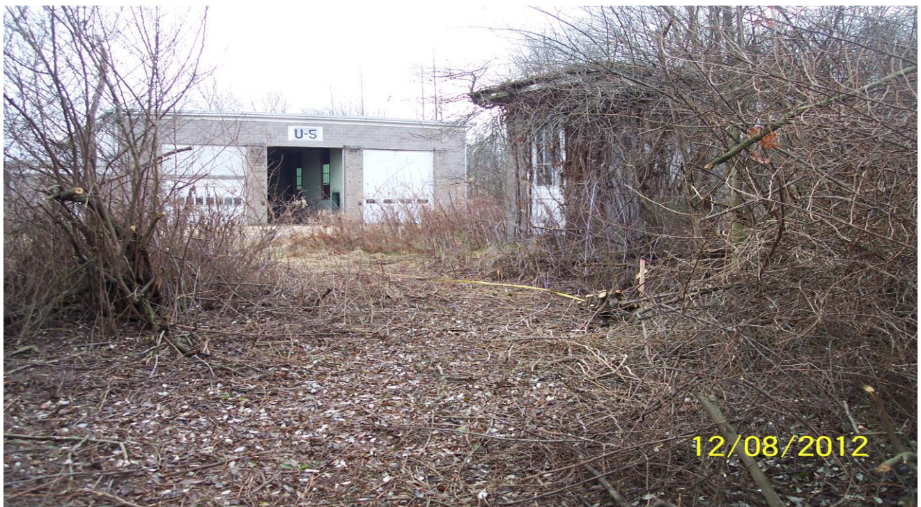
Photo of staked boring locations to the northeast of Bldg. U-6. View is looking south southwest.