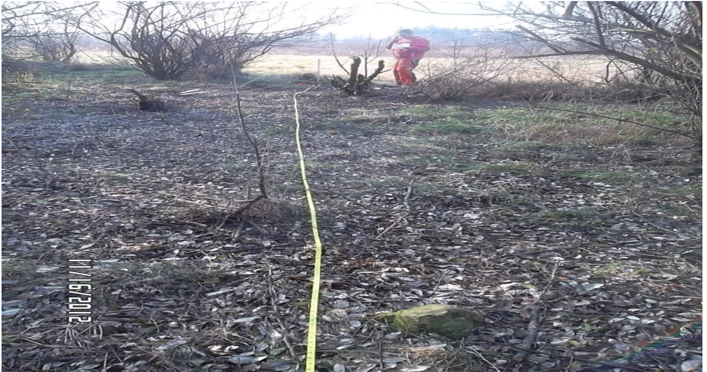
Measuring excavation area of former USTs RV-17, RV-18, and RV-19. View is looking to the south.