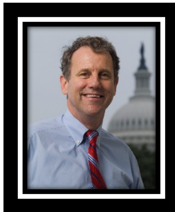
Senator Sherrod Brown (D) 713 Hart Senate Office Building Washington, D.C. 20510