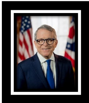
Governor Mike Dewine