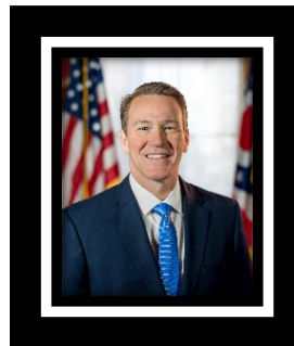
Lt. Governor Jon Husted

Riffe Center, 30 th Floor 77 South High St. Columbus, Ohio 43215-6117 Office- (614) 466-3555