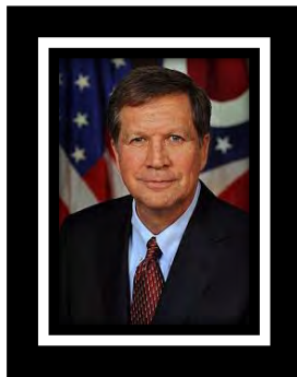
Governor John R. Kasich