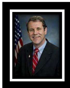
Senator Sherrod Brown (D) 713 Hart Senate Office Building Washington, D.C. 20510 Office (202) 224-2315