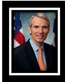
Senator Robert Portman (R) 448 Russell Senate Office Building Washington, D.C 20510 Office (202) 224-3353

https://www.portman.senate.gov/public/index.cfm/contact-form