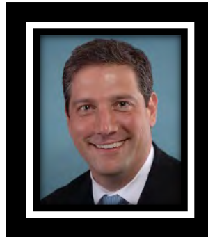
US Congressman Tim Ryan District 13 (D) U.S. House of Representatives 1421 Longworth HOB Washington, DC 20515 (202) 225-5261