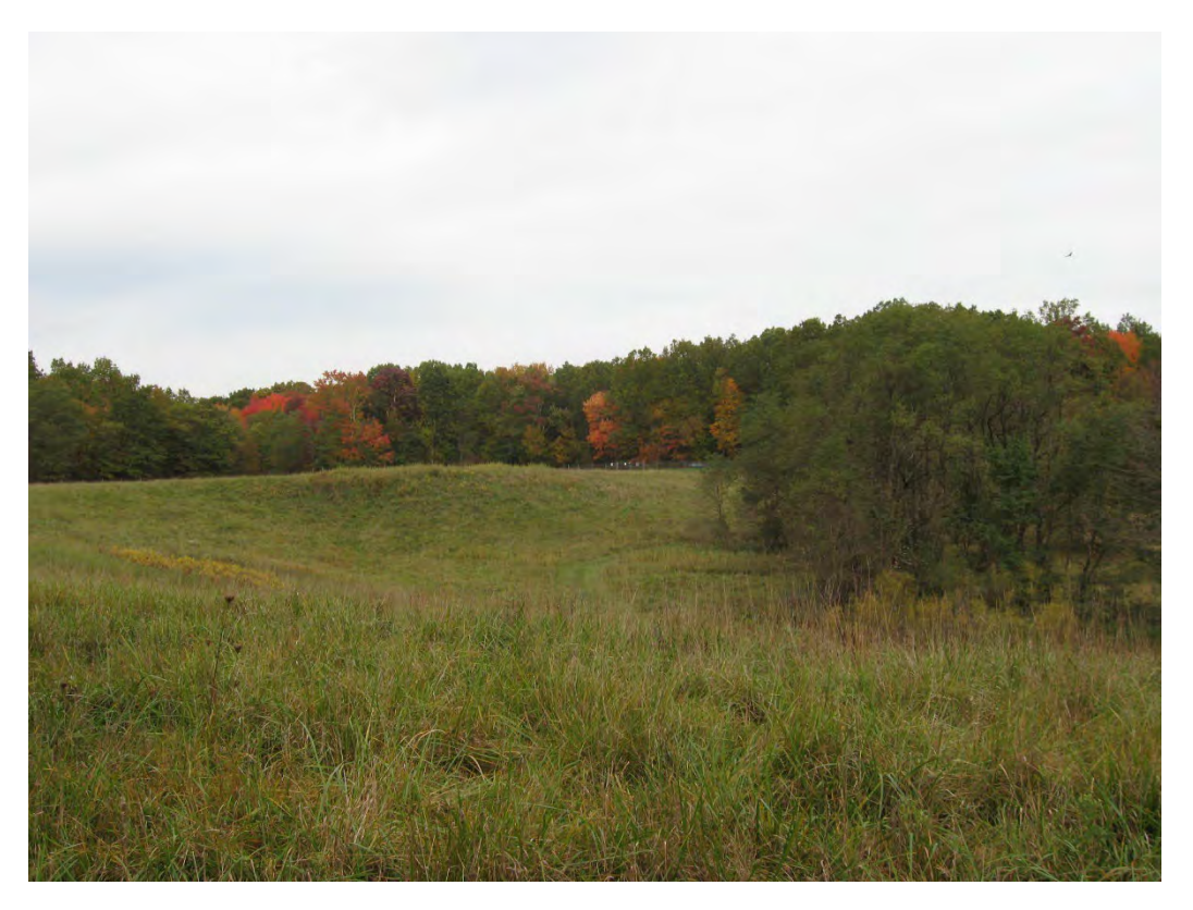
B3. Northwest portion of Ramsdell Quarry Landfill, from the south looking northwest.