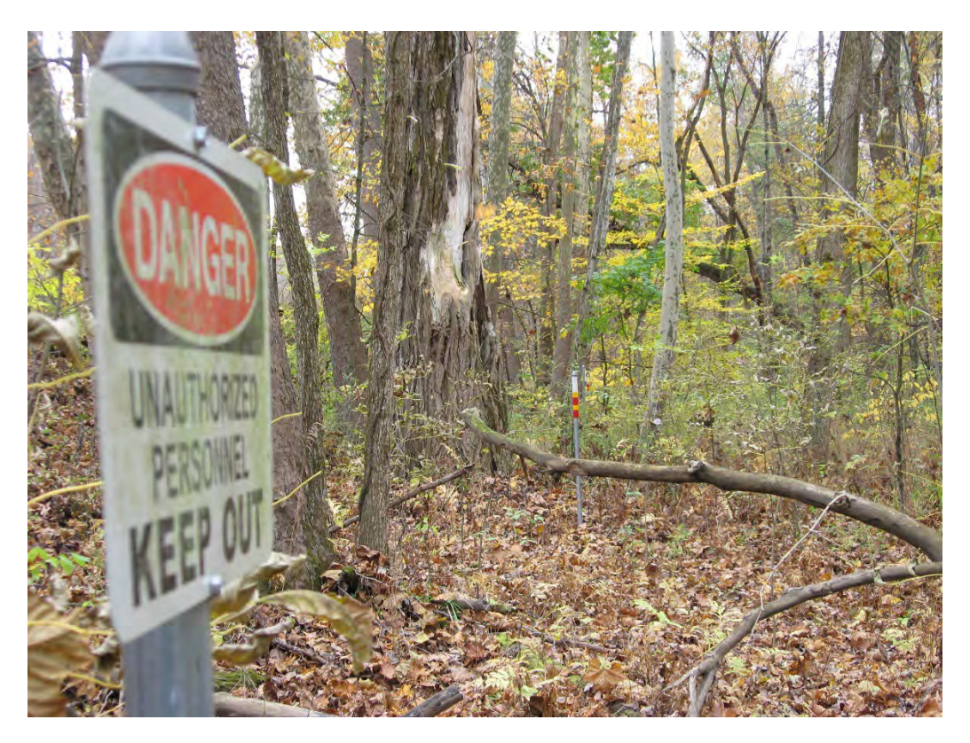
F2. View of the RVAAP-51 AOC, showing a warning sign and Seibert Stake from the western portion of the site looking to the southeast.