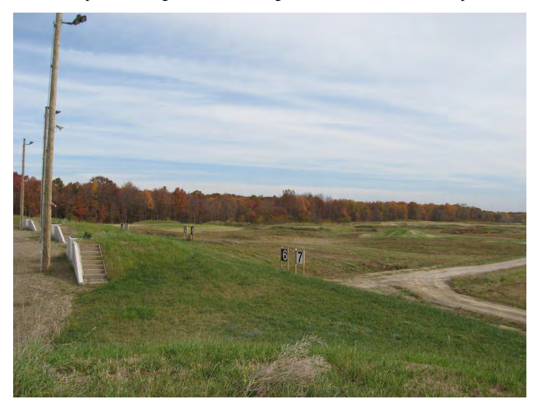
D4. Winklepeck Burning Grounds, looking north from the western portion of the site.