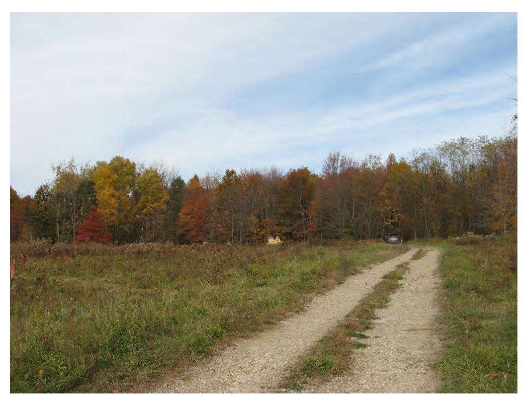
C2. Open Demolition Area #2 looking north from main access road, showing portions of the soil cover/source area and kick-out area.