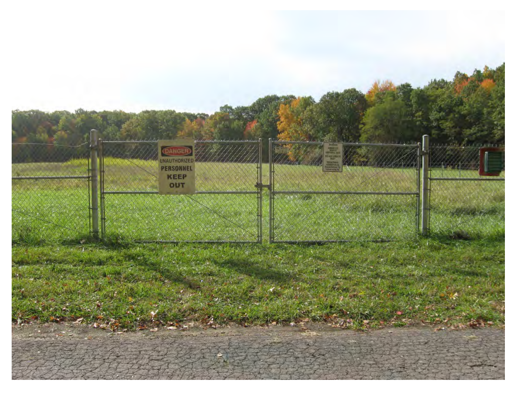
B1. Northwest gate at Ramsdell Quarry Landfill.