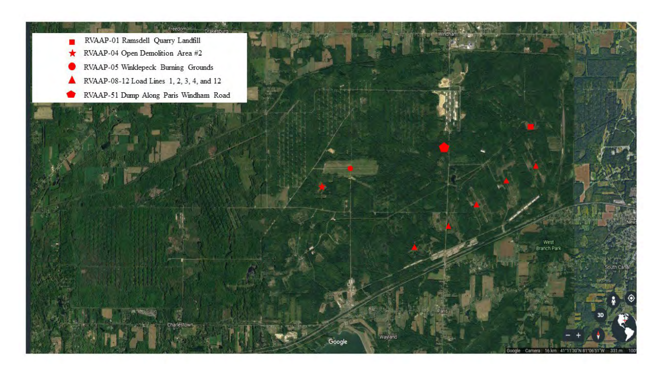
Figure 1.0 Land Use Control Areas at Camp James A. Garfield Joint Military Training Center (Former Ravenna Army Ammunition Plant)

Camp James A. Garfield is located in northeastern Ohio within Portage and Trumbull counties and is approximately three miles east/northeast of the City of Ravenna and one mile north/northwest of the City of Newton Falls. The facility is approximately 11 miles long and 3.5 miles wide. The facility is bounded by State Route 5, the Michael J. Kirwan Reservoir, and the CSX System Railroad to the south; Garrett, McCormick, and Berry Roads to the west; the Norfolk Southern Railroad to the north; and State Route 534 to the east, as shown in Figure 1. In addition, the facility is surrounded by the communities of Windham, Garrettsville, Charlestown, and Wayland.