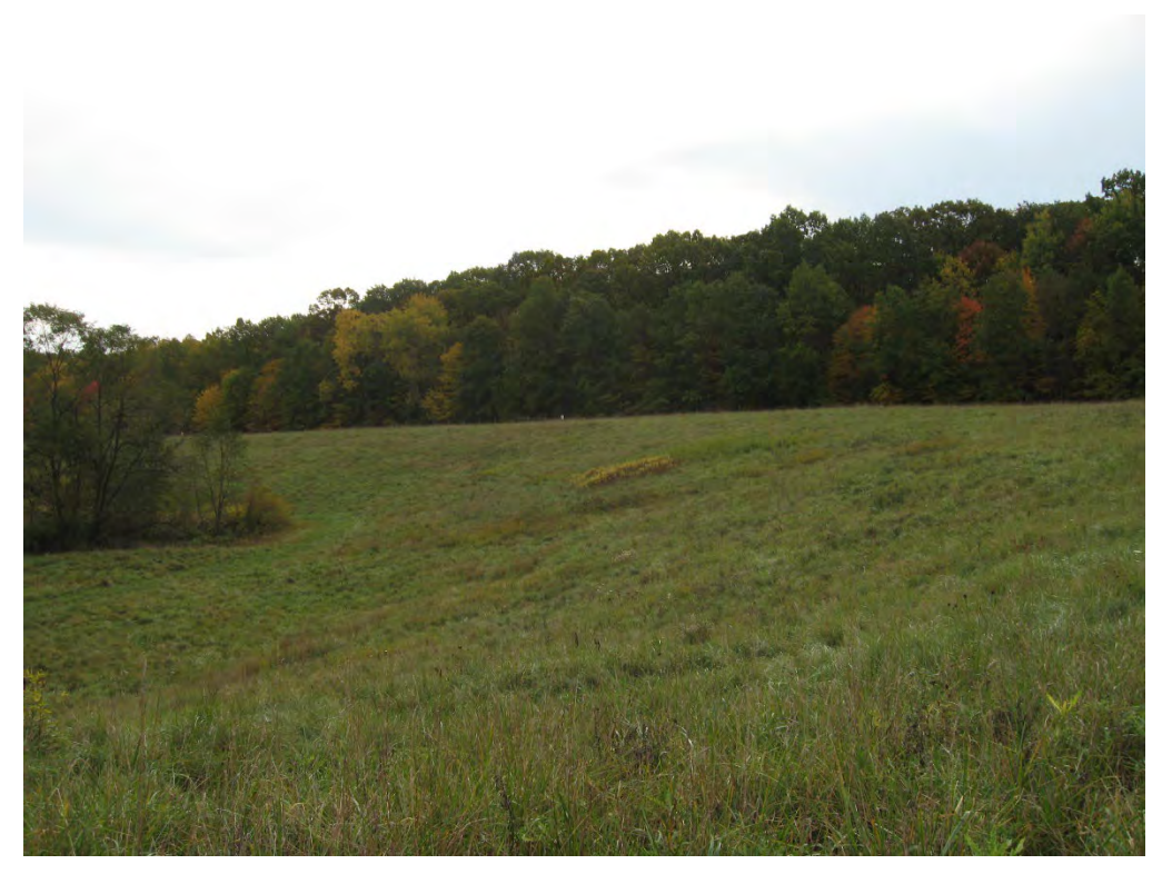
B2. Southern portion of Ramsdell Quarry Landfill, looking east from the western portion of the site.