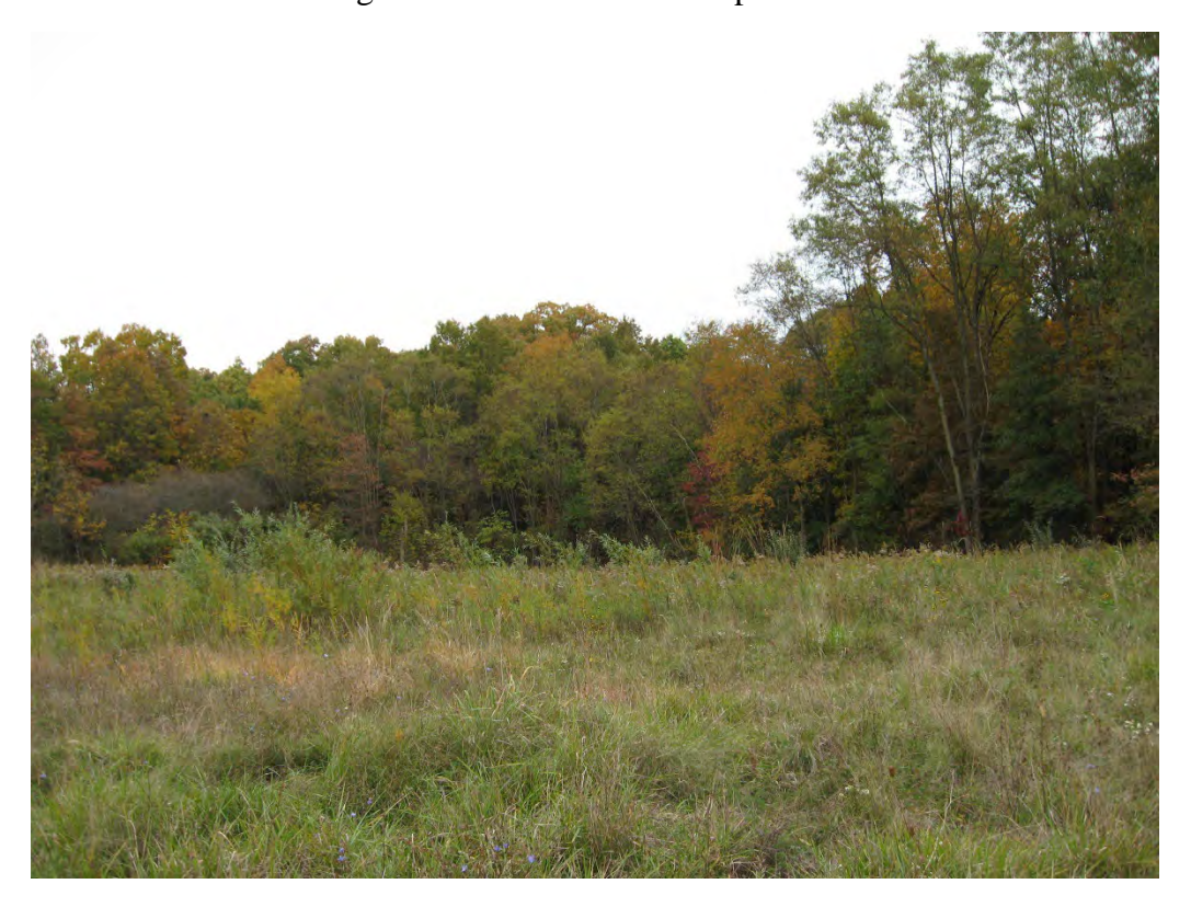
E2. Load Line 1, from central western portion of the site looking east.