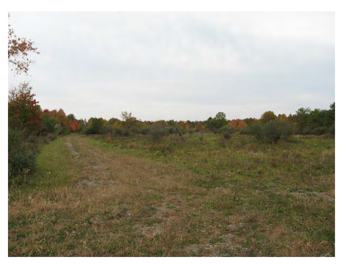
E3. Load Line 2, looking north from southern access road.