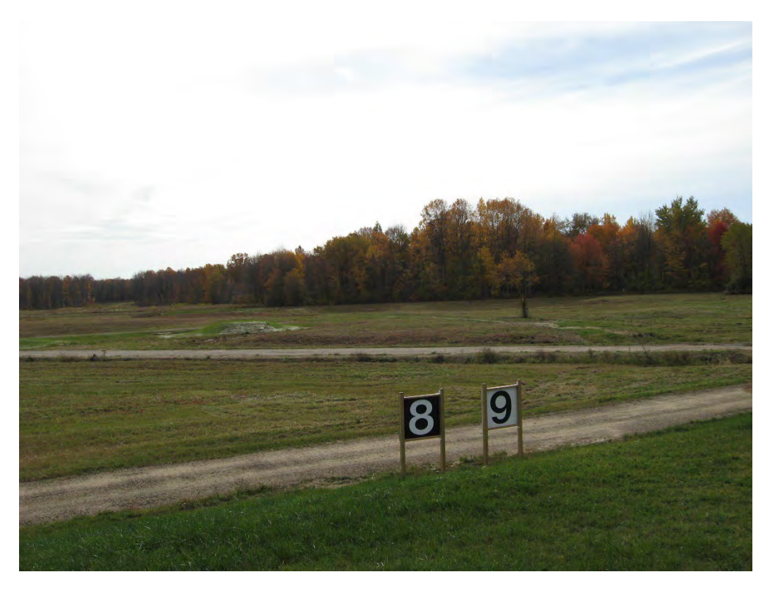
D1. Winklepeck Burning Grounds, looking south from the western portion of the site.