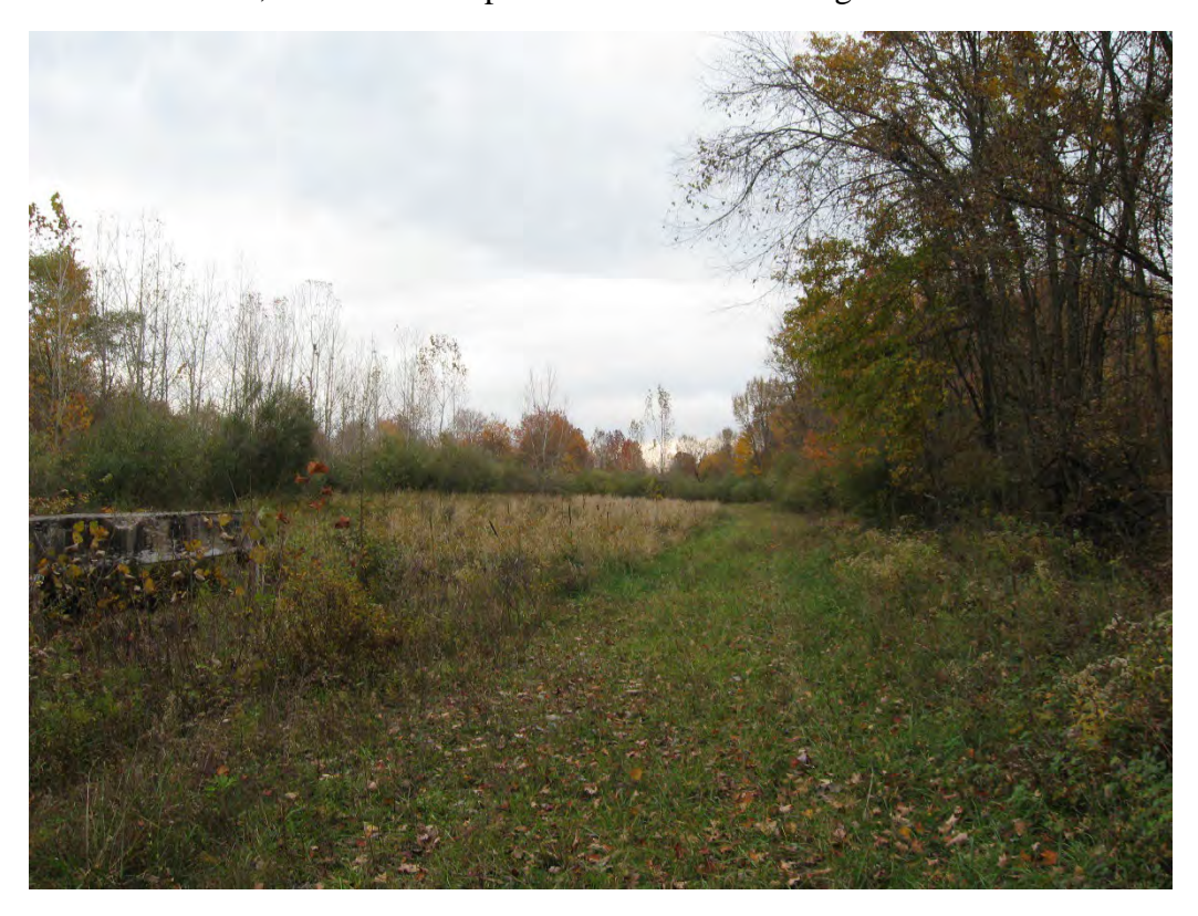
E6. Load Line 3, looking south from the west-central portion of the site.