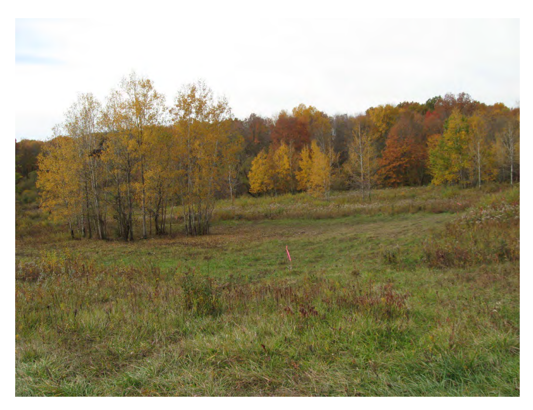
C3. Open Demolition Area #2 looking southwest from north-central portion of the site, showing portions of the soil cover/source area and kick-out area.