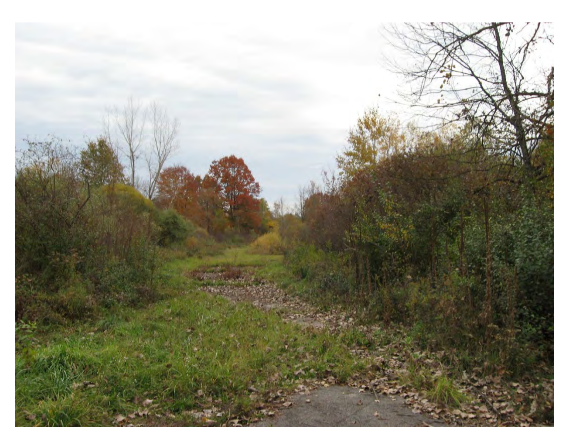
E9. Load Line 12, from the northern portion of the site looking south.