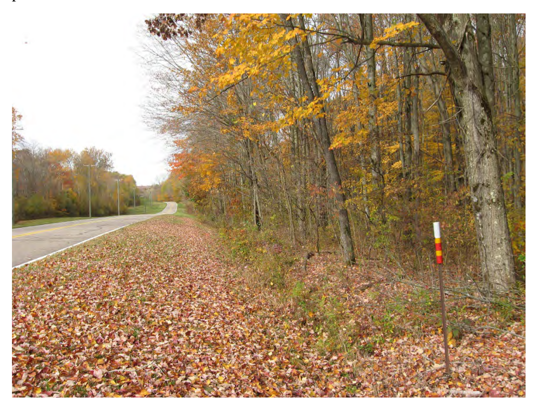
C4. Open Demolition Area #2. Seibert stakes and warning signs along Newton Falls Road.