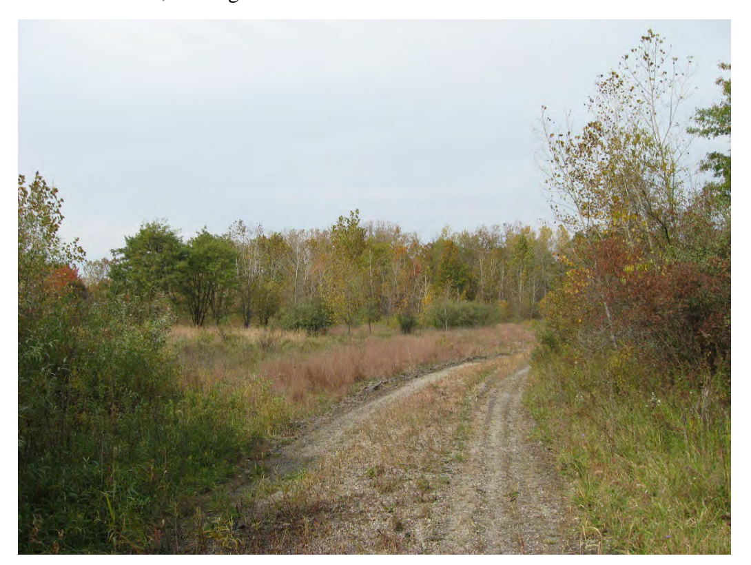
E4. Load Line 2, from northern portion of the site looking south.