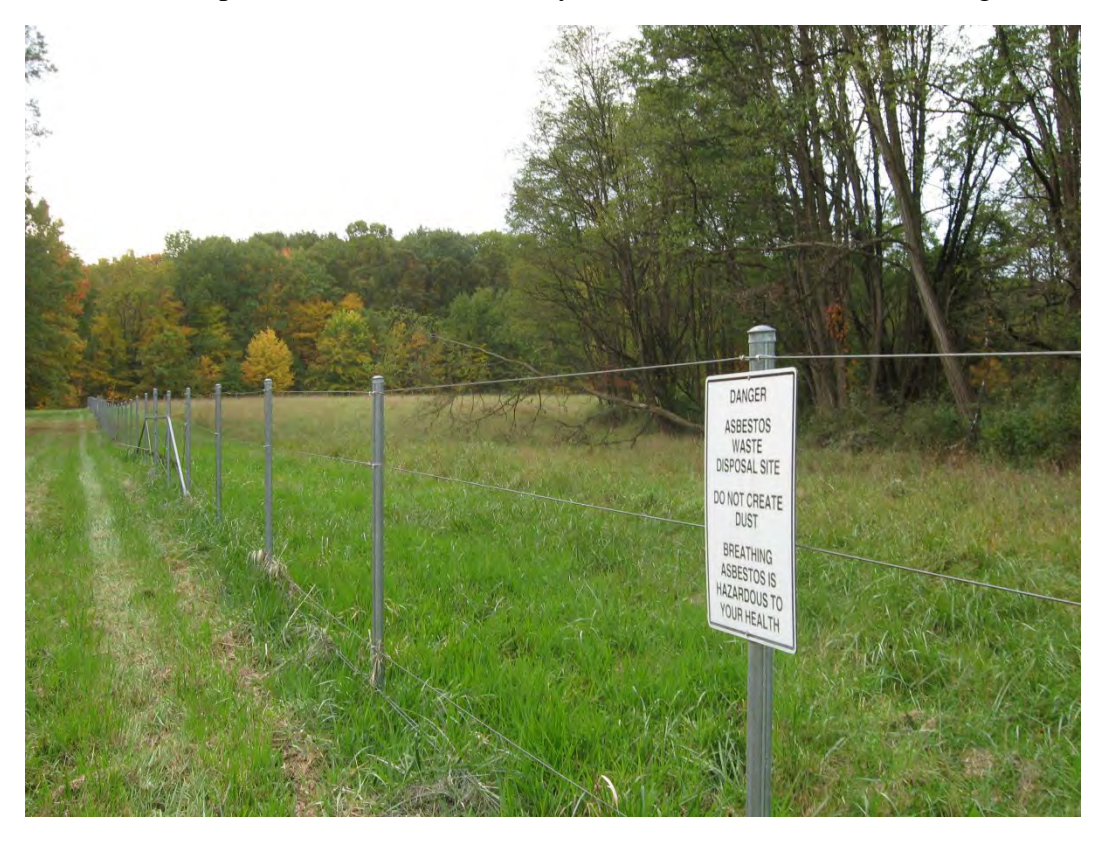
B4. Eastern fence line of Ramsdell Quarry Landfill, looking south from the northeast.