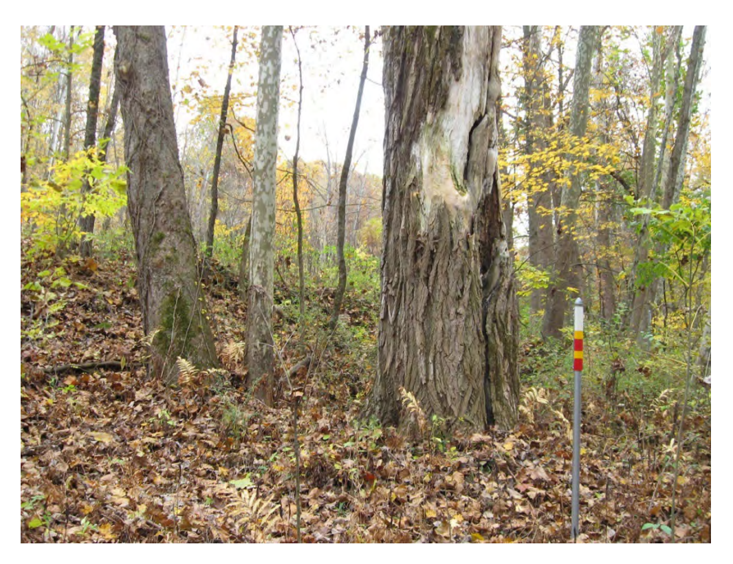
F3. View of the RVAAP-51 AOC, showing the area looking east towards Paris-Windham Road from the west-central portion of the site.