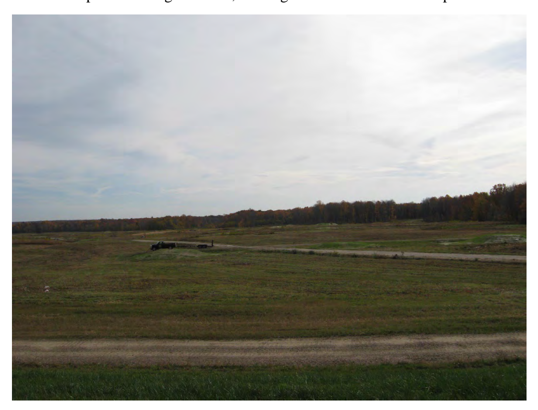
D2. Winklepeck Burning Grounds, looking southeast from the western portion of the site.