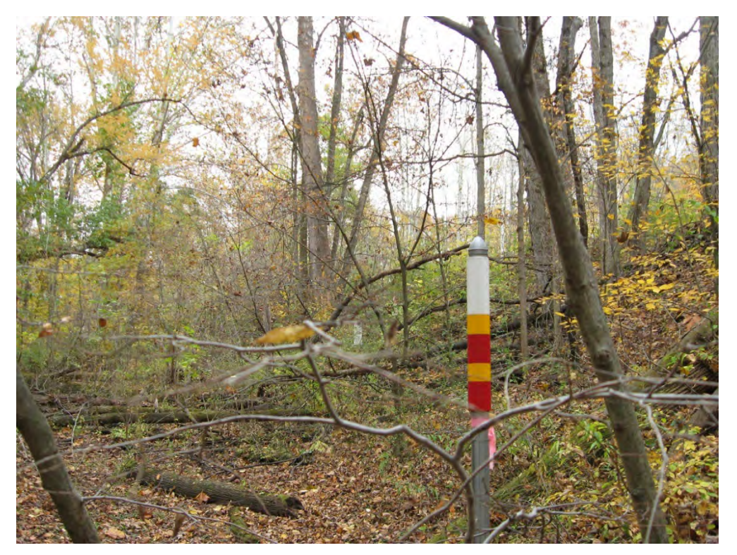
F4. View of the RVAAP-51 AOC, showing the area looking south from the northwestern portion of the site.