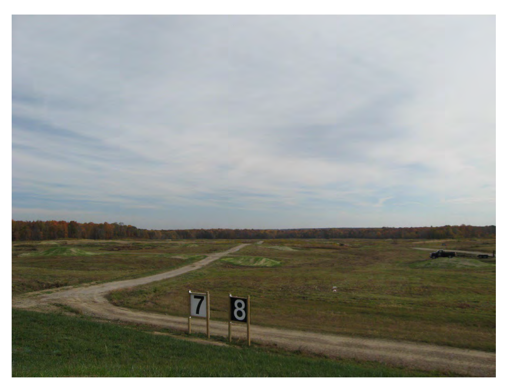
D3. Winklepeck Burning Grounds, looking northwest from the western portion of the site.