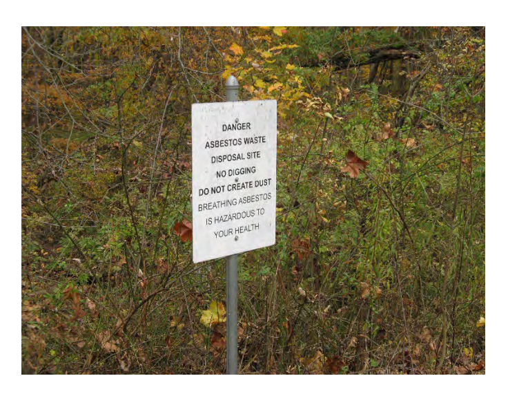
F1. View of the RVAAP-51 AOC, showing an asbestos warning sign along Paris-Windham Road.