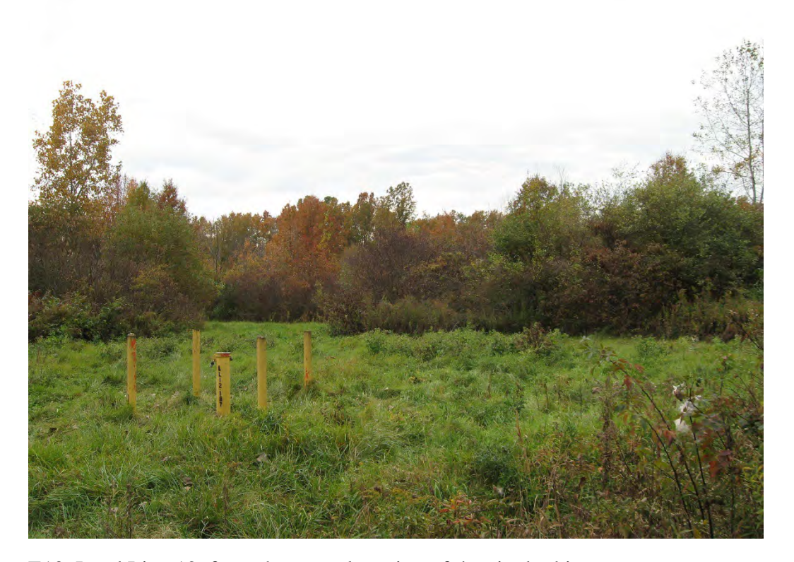
E10. Load Line 12, from the central portion of the site looking west.