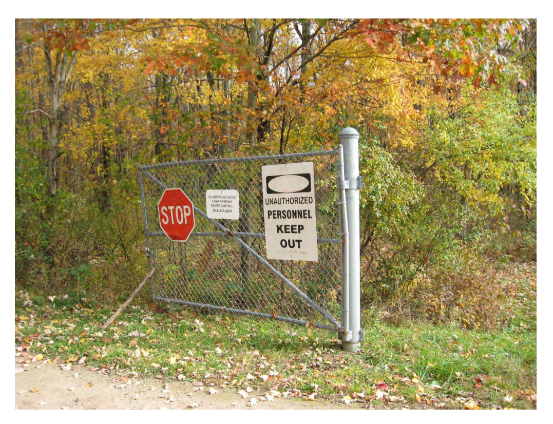
C1. Main gate at Open Demolition Area #2.