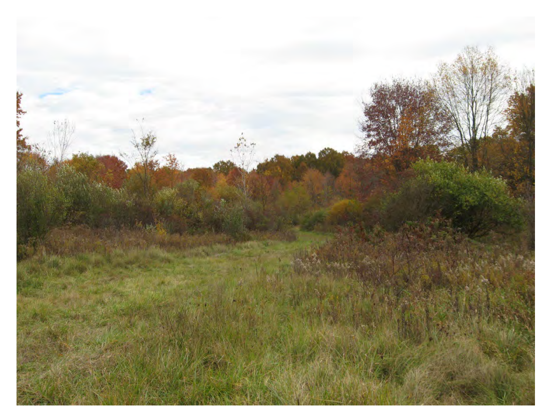
E5. Load Line 3, from southern portion of the site looking north.