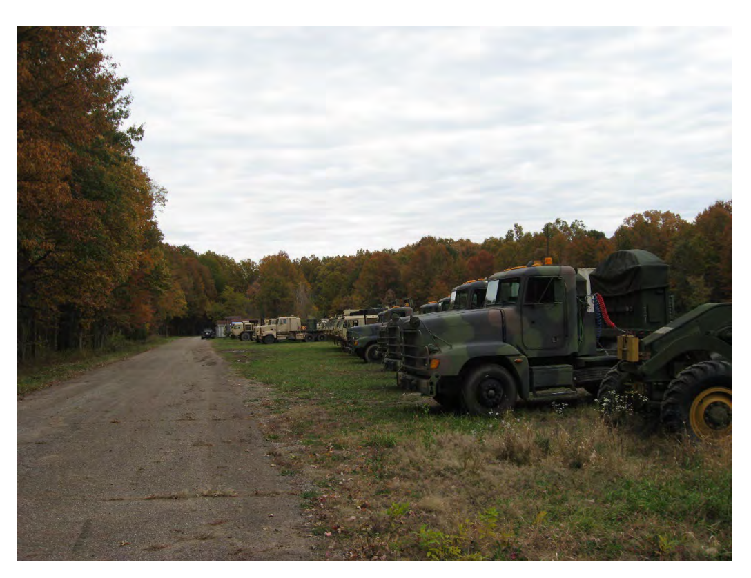
E7. Load Line 4, military vehicles staged in northwestern portion of the site.