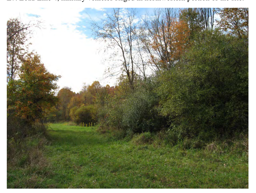
E8. Load Line 4, from the central portion of the site looking north.