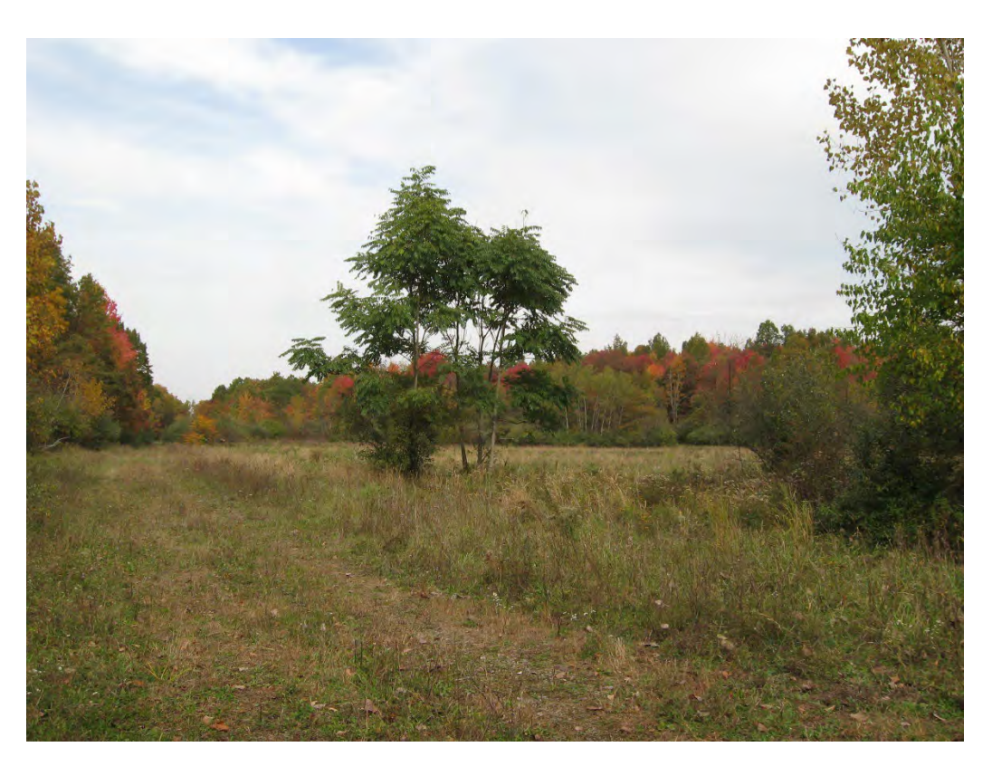
E1. Load Line 1 looking north from south-central portion of the site.